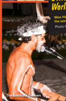
The Butchulla Dancers